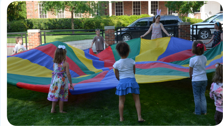
Parachute fun at the 2011 Easter Celebration

Last Day of Sunday School/Teacher Appreciation